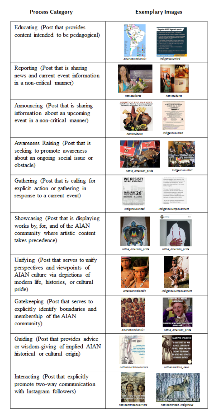
Figure 2: Image Category Examples (the Instagram handle of the original poster is below the images)

category were nonetheless bound by the desire to capture AIAN identity through depiction across these gradients.