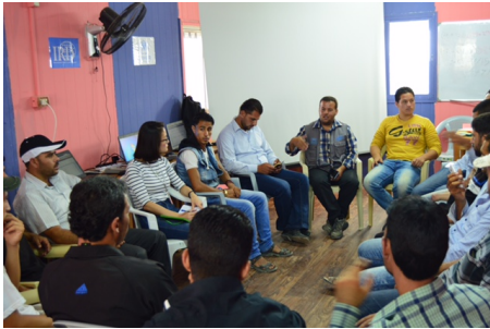
Figure 4: Discussing Data Collection Experience and Strategizing for the Next Day

assets, such as frequencies, using the built-in visualization tool in Kobo Toolbox. However, for trainees who had no particular interests, they would like to explore the raw data sheets in order to gain a preliminary understanding of the types of questions they could ask. Later, after determining which assets they were interested in, trainees sought to find out if anyone in their own neighborhood has that asset. In general, the data analysis is challenging due to the lack of demand or skills among the trainees. Most of the trainees focused on asking and answering simple yes-or-no questions: whether such an asset exists, for instance. However, this only reflects a small portion of what the data can offer. Figure 5 shows trainees participating in the asset mapping training in a computer lab in the camp.