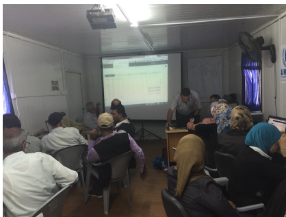
Figure 5: Training in a computer lab (a Syrian was showing his procedure of analyzing the asset data)

assets, such as frequencies, using the built-in visualization tool in Kobo Toolbox. However, for trainees who had no particular interests, they would like to explore the raw data sheets in order to gain a preliminary understanding of the types of questions they could ask. Later, after determining which assets they were interested in, trainees sought to find out if anyone in their own neighborhood has that asset. In general, the data analysis is challenging due to the lack of demand or skills among the trainees. Most of the trainees focused on asking and answering simple yes-or-no questions: whether such an asset exists, for instance. However, this only reflects a small portion of what the data can offer. Figure 5 shows trainees participating in the asset mapping training in a computer lab in the camp.