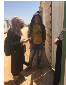
Figure 3: Data Collection

6.3.1 Asset Data Collection. Figure 3 shows the typical process of data collection the camp: a team of refugee trainees use an Android device to facilitate asset data collection with members of a household that they visited.