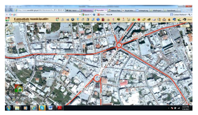
Figure 3: Ramallah Municipality's Online Tourist Map<sup>14</sup>

This is not the case in Ramallah, as demonstrated by the municipality's online tourist map (see Figure 3), with extensive labeling of street names. The municipality decides street names through use of a committee with approval granted from the City Council<sup>13</sup>. City employees did report one instance where Israel protested the naming of a street but the name was not changed and the matter closed. Therefore, despite the existence of adequate data, commercial online map providers such as Google have, for unknown reasons, yet to incorporate these data.